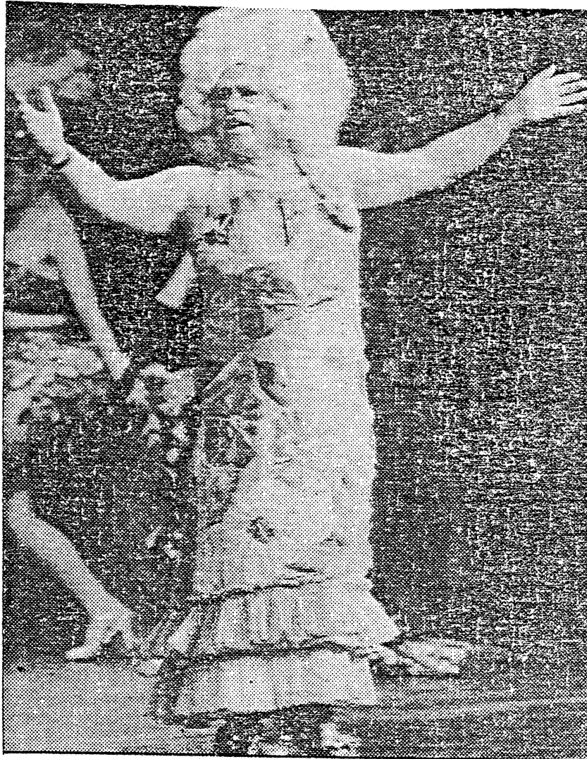
THAT'S SOME BABY